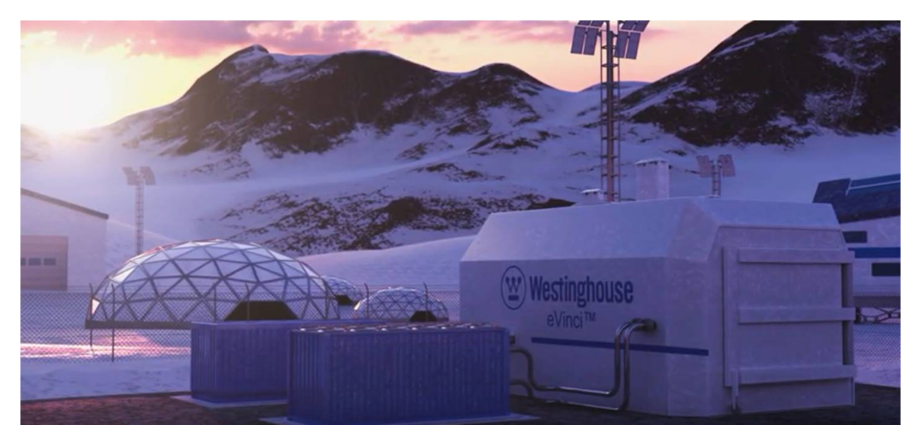
Figure 4 eVinci Site Layout

There are three main systems that will be located onsite: the eVinci Micro Reactor system; the power conversion system; and the instrumentation, control and electrical system. Offsite, there is a remote monitoring system that can be used to monitor and operate either a single or multiple eVinci Micro Reactors.