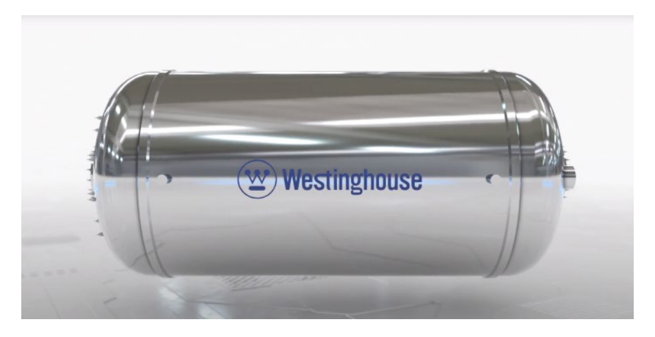
Figure 1 eVinci Reactor Module

The eVinci Micro Reactor's innovative design is a combination of space reactor technologies and 50+ years of commercial nuclear systems design, engineering and innovation. The eVinci Micro Reactor aims to create competitive and resilient power with superior reliability and minimal maintenance, particularly for energy consumers in remote locations. Its small size allows for standard transportation methods and rapid, on-site deployment in contrast to large, centralized stations. The reactor core is designed to run for three or more years, eliminating the need for frequent refueling.